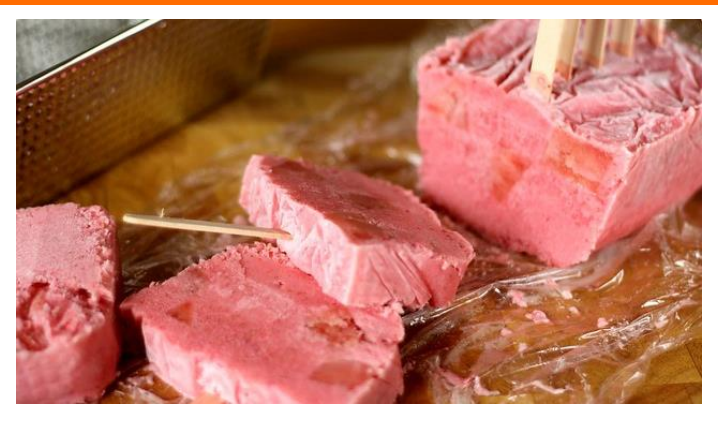
Strawberry Watermelon Yogurt Ice Pops Makes 8-10 servings

Cal 109 | Fat 4.7g | Carb 12.6g | Protein 3.6g | Fibre 1.1g | Sodium 107.9mg