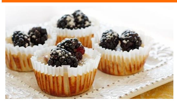
Lemon Cheesecake Yogurt Cupcakes