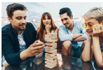
Play a game.