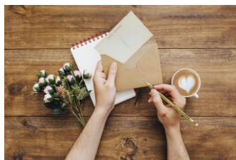
Send a thank you card.