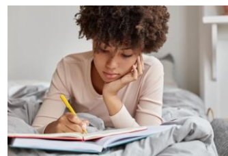
Write in your journal.