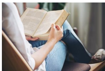
Read a good book.