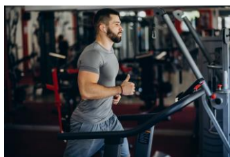
Work up a sweat!