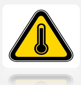
Signs of Dehydration