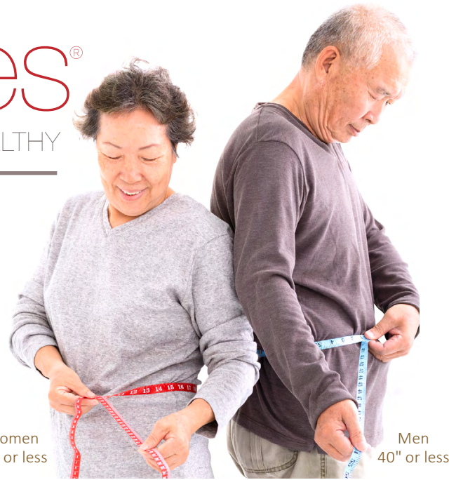
Women 35" or less