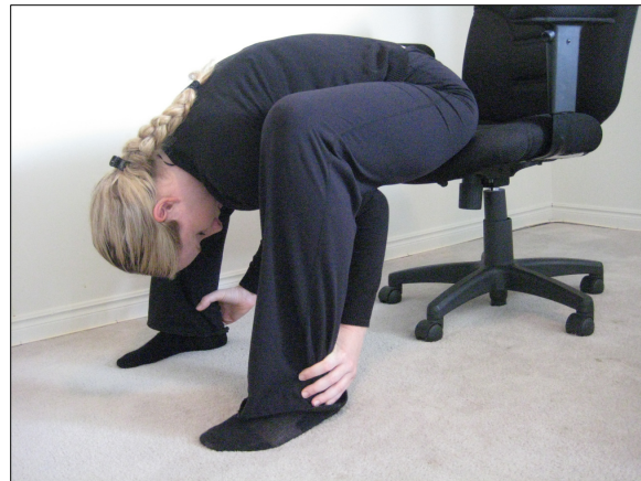
Figure 2: Hands at ankles