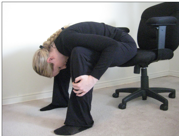
Figure 3: Hands at shins