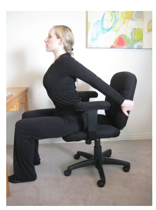
Figure 3: Hands holding on to the back of the chair